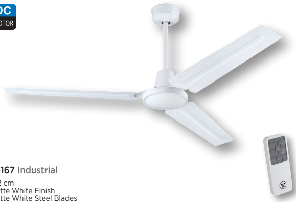
73167 Industrial 142 cm Matte White Finish Matte White Steel Blades Remote Control Included